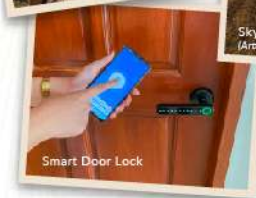
Smart Door Lock