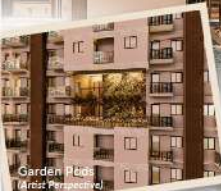
Garden Plot (Artist Perspective)