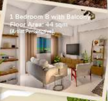
1 Bedroom B with Balcony Floor Area: 44 sqm (Artist Perspective)