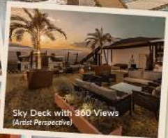
Sky Deck with 360 Views (Artist Perspective)