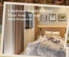
1 Bedroom A with Balcony Floor Area: 30 sqm (Artist Perspective)